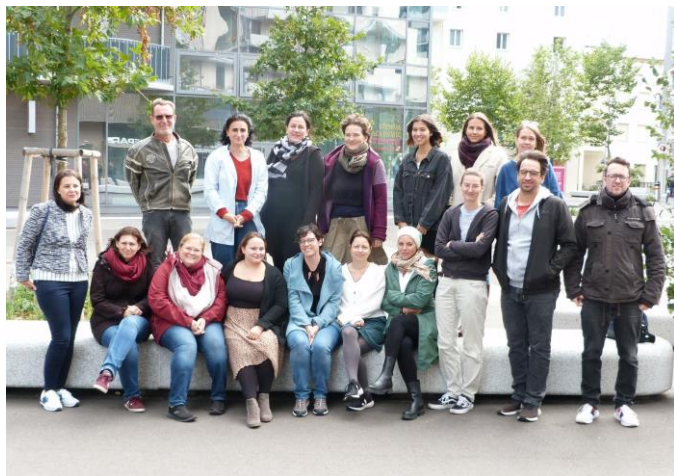
Youth Coaching Team at Compulsory Schools