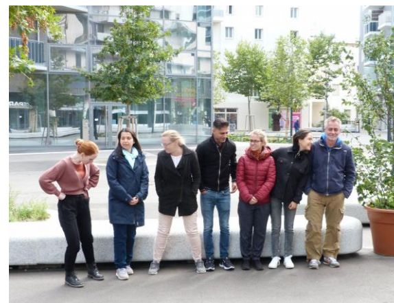
Youth Coaching Team at Secondary academic schools - upper cycle